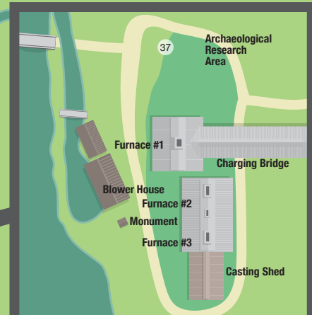
37 • Furnace Area